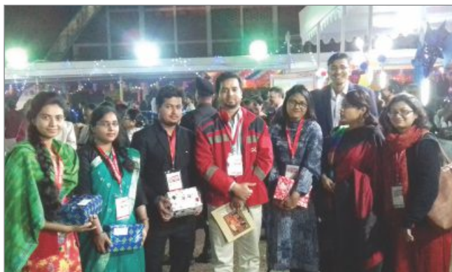
EDAS BASH 2018