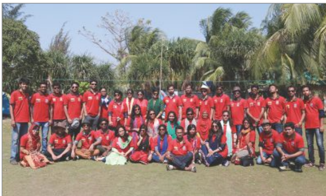
Tour to Saint Martin's Island 2017