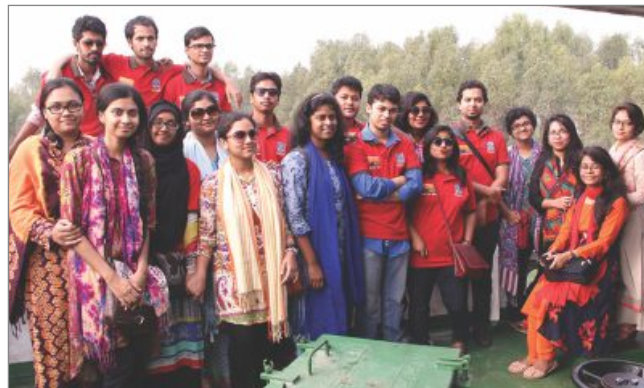
Tour to Saint Martin's Island 2017