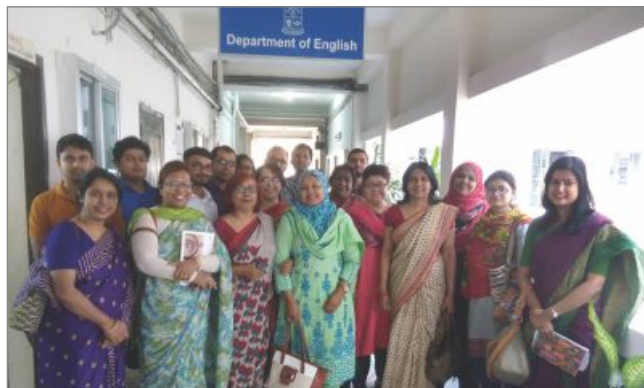
After a Faculty Development Seminar