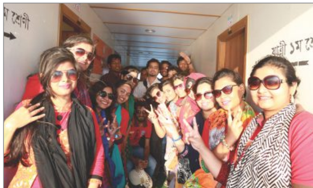
Tour to Saint Martin's Island 2017