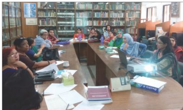
Academic Committee Meeting