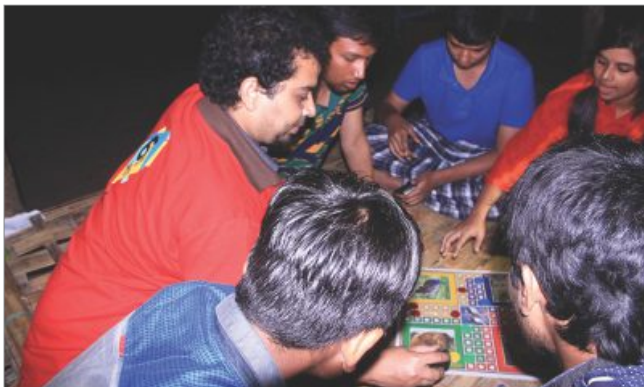
Tour to Saint Martin's Island 2017