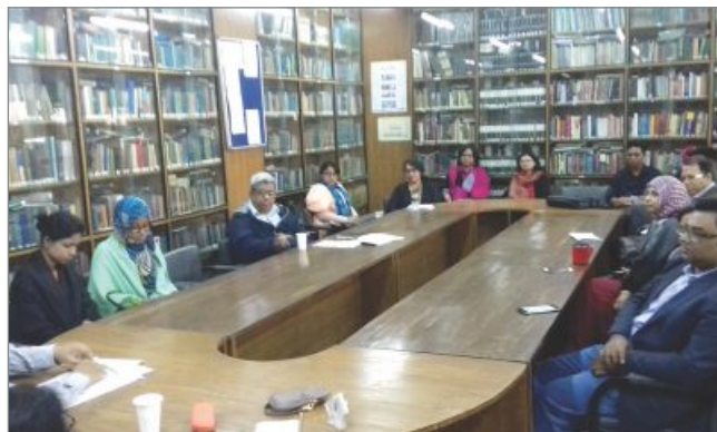
PhD Seminar 2018