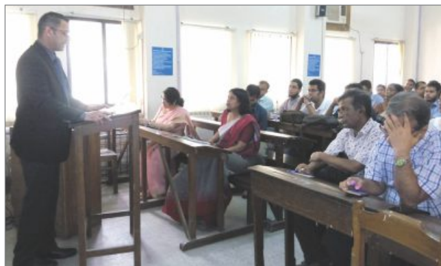
Faculty Development Lecture