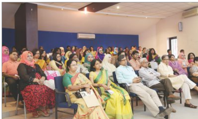
Women's Day Celebration 2017