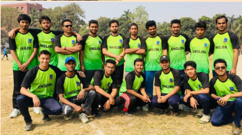
Football team (top left), Basketball team (top right) and Cricket team (bottom)