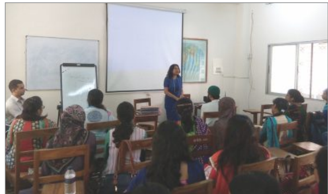
Classroom Presentation 2017