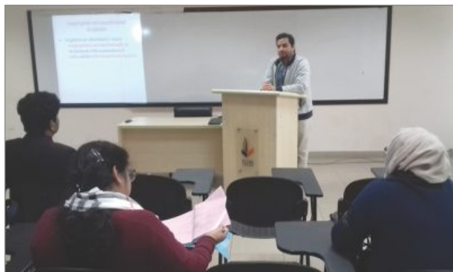
Presenting at 8th BELTA International Conference 2018