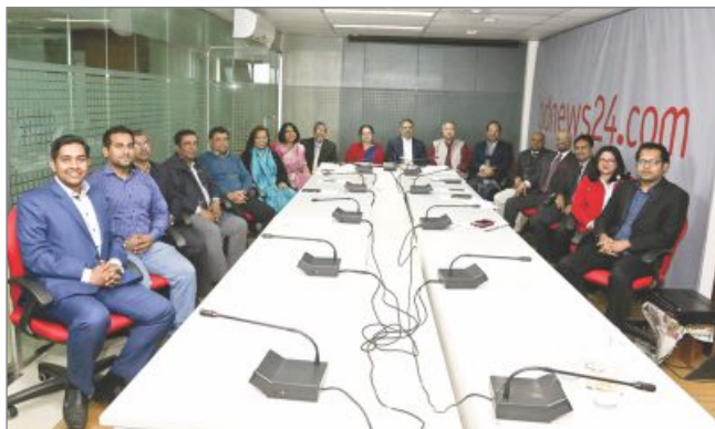
EDAS Executive Meeting 2017