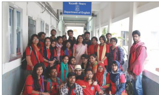
With Dept. Chair before Tour to Saint Martin's Island