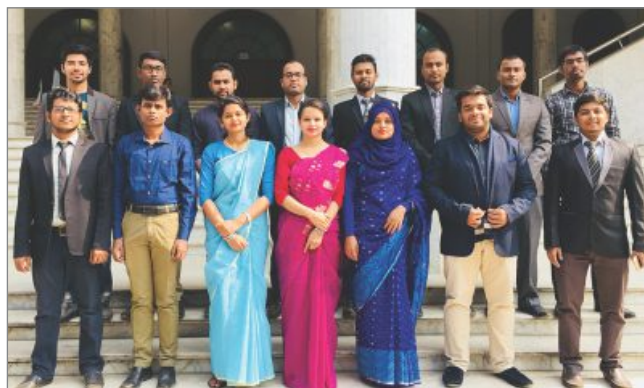
MA ELT Batch 8