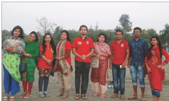
Tour to Saint Martin's Island 2017