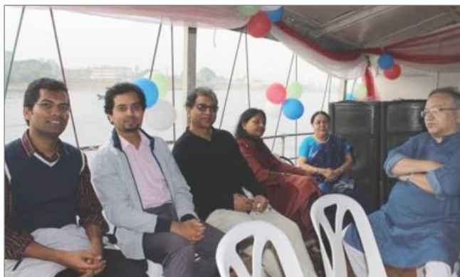
EDAS River Cruise 2017