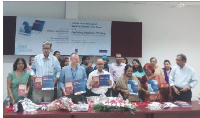
Book Launch Ceremony 2017