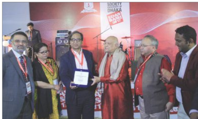
EDAS BASH 2017