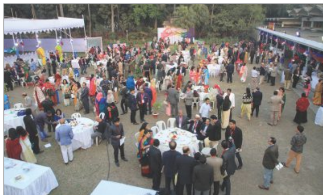
EDAS BASH 2017