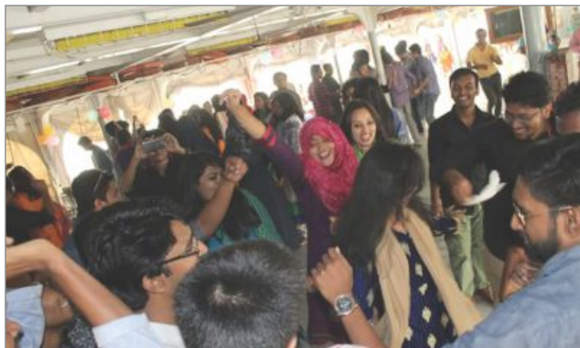
EDAS River Cruise 2017