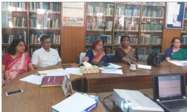
IQAC Workshop 2017