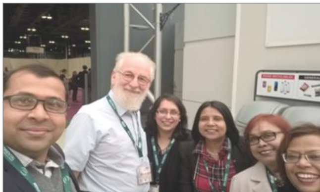
With Prof. David Crystal at IATEFL Conf., Glasgow, UK, 2017