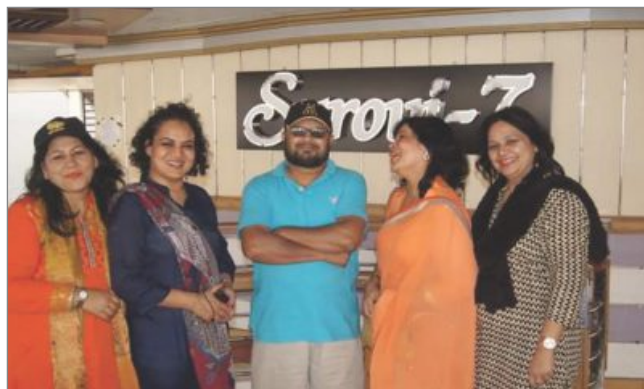
EDAS River Cruise 2017