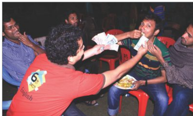
Tour to Saint Martin's Island 2017