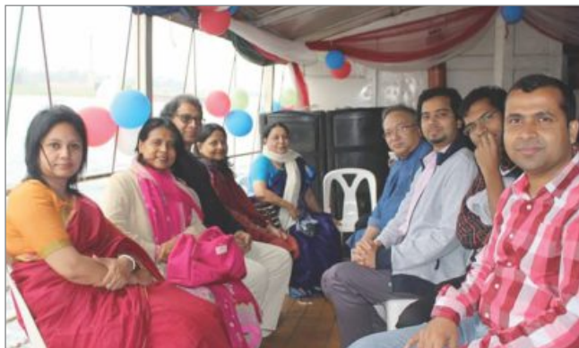
EDAS River Cruise 2017