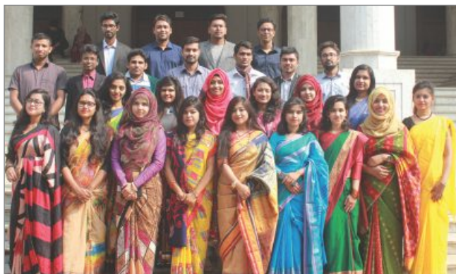
MA Literature Batch 8