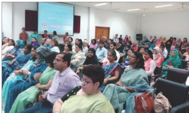
Engrossed Audience at a Department Programme