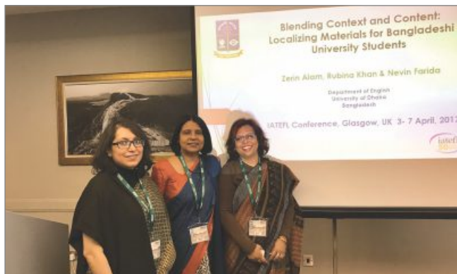
At IATEFL Conference, Glasgow, UK, 2017