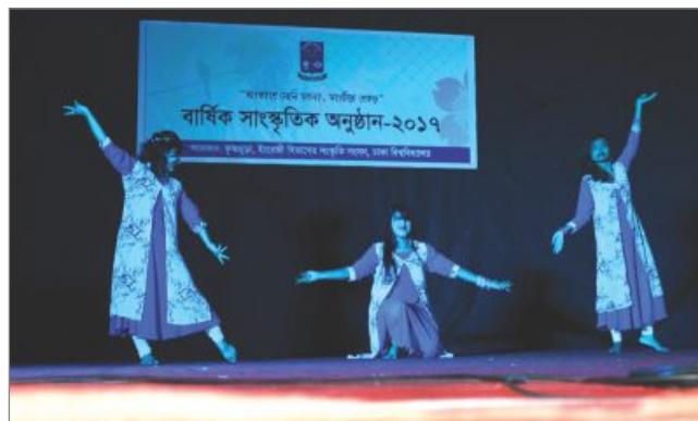
Kirshnachura Cultural Event