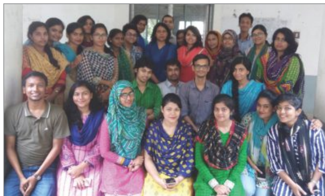
MA ELT Batch 6