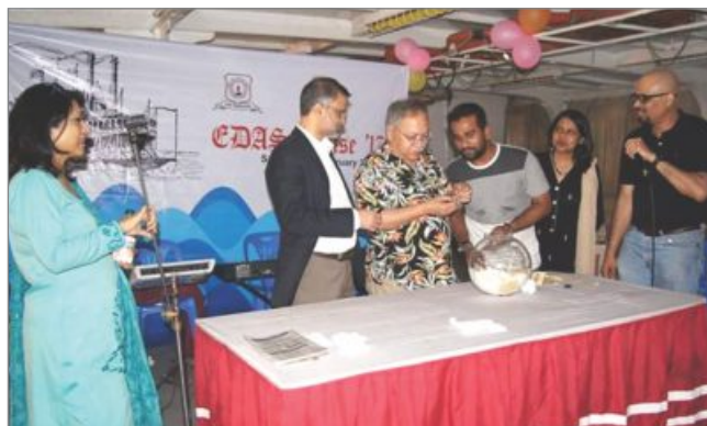
EDAS River Cruise 2017